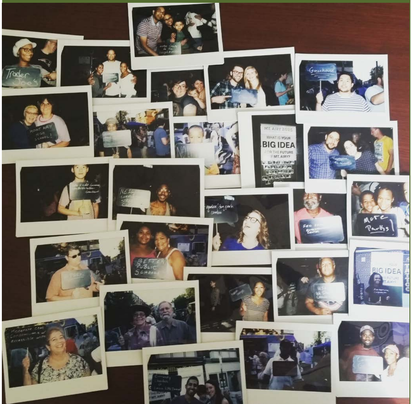
Figure F: the resident engagement process for Mt. Airy 2025 leverage existing community events to gather information and input. On September 17, 2015, planning team members attended the Mt. Airy Street Fare and interacted with dozens of residents about their aspirations (or BIG IDEAS) for the neighborhood

Finally, a third public meeting was held at Pleasant Playground on December 17, 2015. At this meeting, a set of proposed action items were presented to the general public. 43 residents took part in the process. Comments providing feedback were evaluated and have subsequently been incorporated into this document.