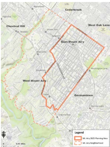
Figure A: Map of Study Area Context.

The Mt. Airy 2025 Study Area was determined in consultation with the Wells Fargo Regional Foundation, which recommends that neighborhood planning areas are compact to facilitate tracking of progress and outcomes after the plan starts being implemented. While the Study Area does not include all of Mt. Airy ( Figure A ), all residents of the entire neighborhood were welcome to participate in the planning process. As illustrated in this report, many of the discussions will focus on issues that affect the entire neighborhood.