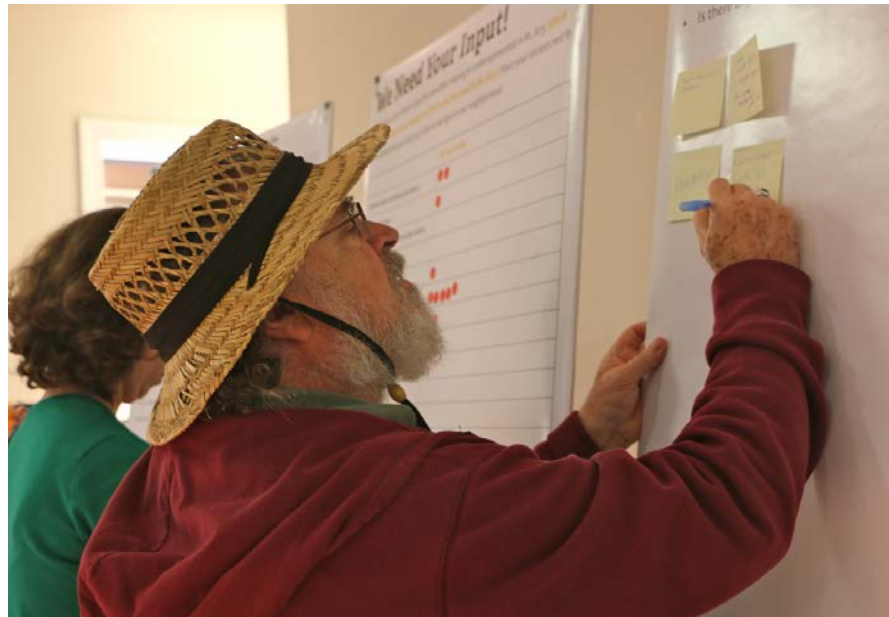
Figure C: Neighborhood residents providing comment at the Open House.

At the heart of Mt. Airy 2025's planning effort is resident and stakeholder engagement. As the project kicked off, the planning team consulted with the steering committee regarding effective outreach strategies and devised a multi-pronged approach in obtaining resident and stakeholder feedback. The public outreach strategy included the use of public meetings and visioning workshops; focus group meetings; stakeholder interviews; a dedicated project website ( mtairy2025.org ), and a social media campaign (i.e. the utilization of #mtairy2025 on Facebook and Twitter).