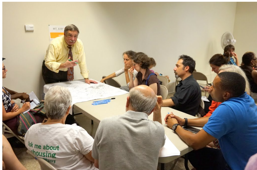
Figure D: Planning team member facilitating discussion at the first public meeting.

On June 24, 2015, the planning team facilitated a public meeting that was held at Mt. Airy Presbyterian Church. Approximately 70 individuals participated in this meeting and rotated through three discussion stations organized into the following topics: Economic Opportunity, Housing, and Quality of Life (see Appendix B for detailed summaries of the discussions).